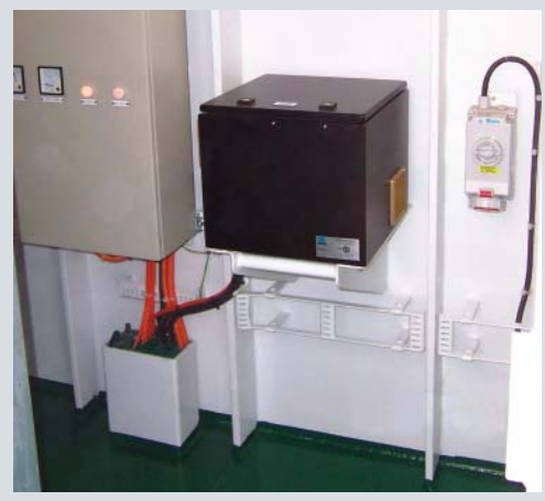
Data Processing Unit (DPU)