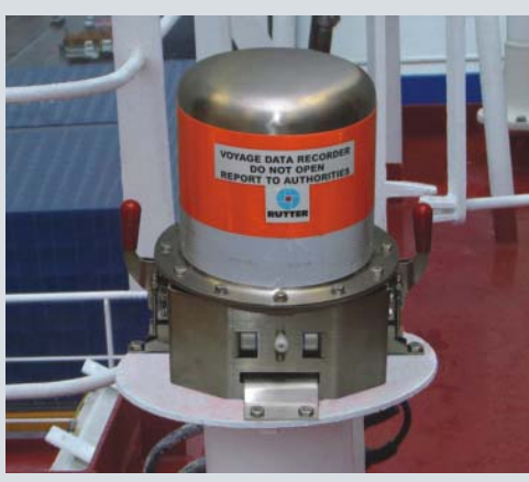
Fixed Final Recording Medium (FRM)